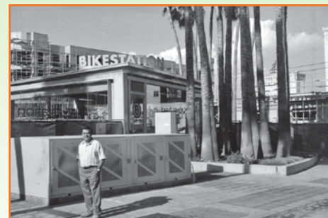
While on vacation, Morteza Ansari visited the bike station in Long Beach, California.

With letters of support from the City of New Brunswick and the Middlesex County Planning Department, KMM applied to develop a Bike Station Implementation Plan for the City of New Brunswick.