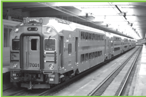
NJTRANSIT's new multi-level cars.

Edison passengers can expect a new 800-space parking lot near the Edison Station. Work on this project has begun and is scheduled for completion in Summer 2008.